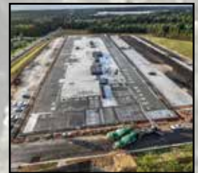
Conyers East Business Center Ernst Concrete of GA