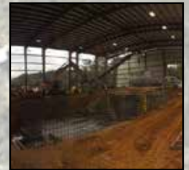
Vista Metals - Casting Pit Precision Concrete Construction