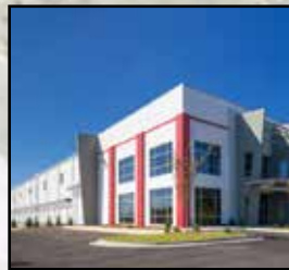
Skyline 20 West Precision Concrete Construction