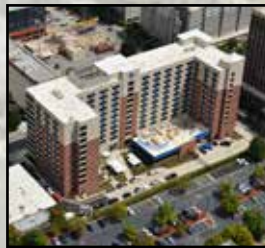
Piedmont Center Student Housing Metromont Corporation