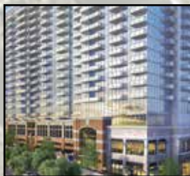
60 11th Street Ready Mix USA