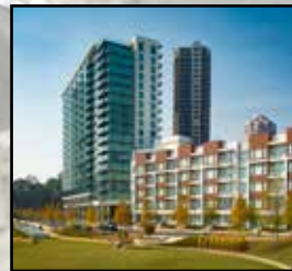
AML 3464 Uzun+Case, LLC