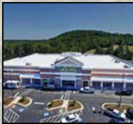
Dawsonville Publix & Retail Shops Ernst Concrete of GA