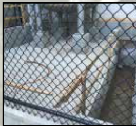
Alcon Laboratories LS3 Expansion Precision Concrete Construction