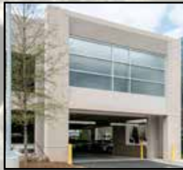
Fiserv Westside Parking Deck Metromont Corporation