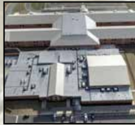
Dean Rusk Middle School Ernst Concrete of Georgia