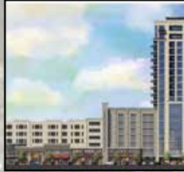
33 Peachtree Ready Mix USA