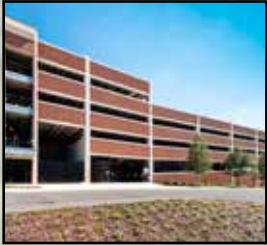
Lofts at Mercer Landing Parking Deck Metromont Corporation