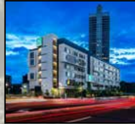
AC Marriott Buckhead Precision Concrete Construction