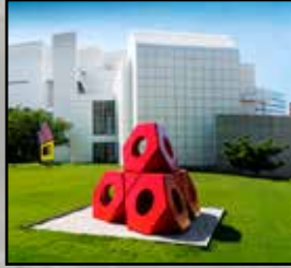
Octetra Metromont Corporation