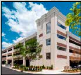
Avalon Central Parking Deck Metromont Corporation