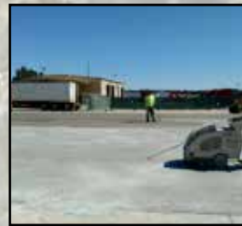
U.S. Xpress RCC Ready Mix USA